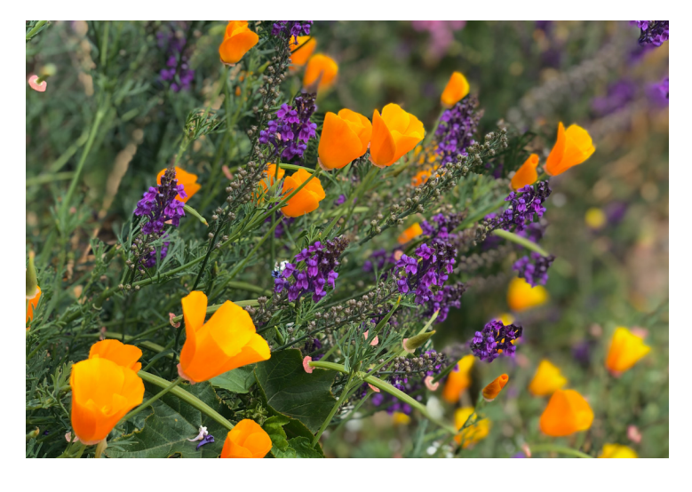
Why do plants have flowers?