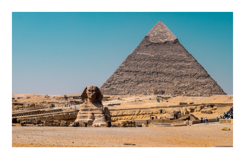
Where are the pyramids found?