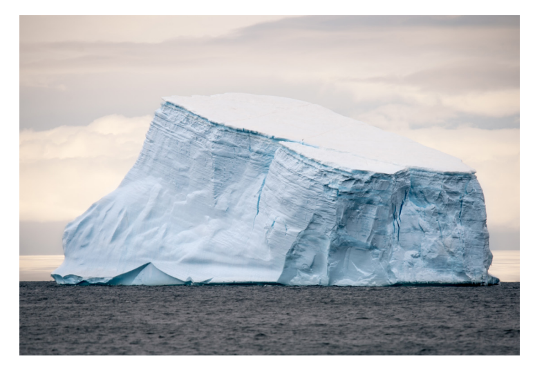
What colors can icebergs be?