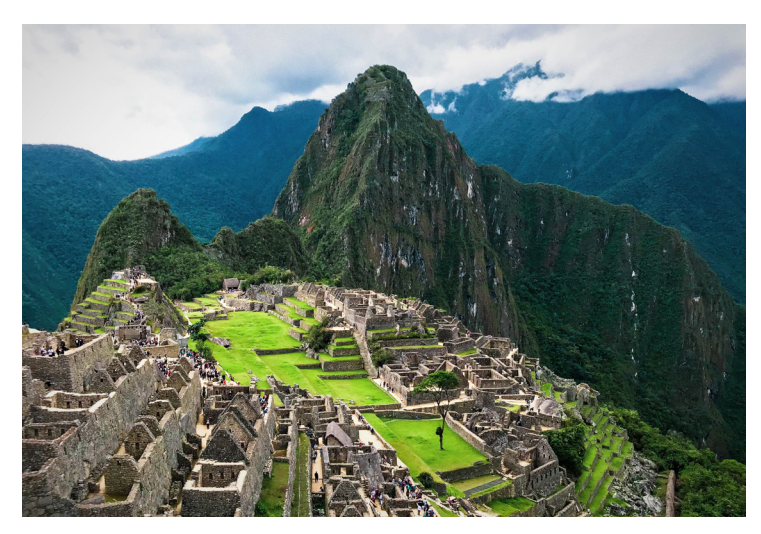
Where was the Inca Empire?