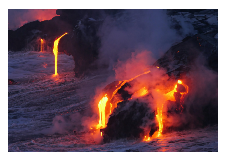
How long did the Kilauea volcano erupt?