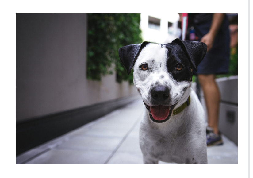
How many dogs were owned in the U.S. in 2011?