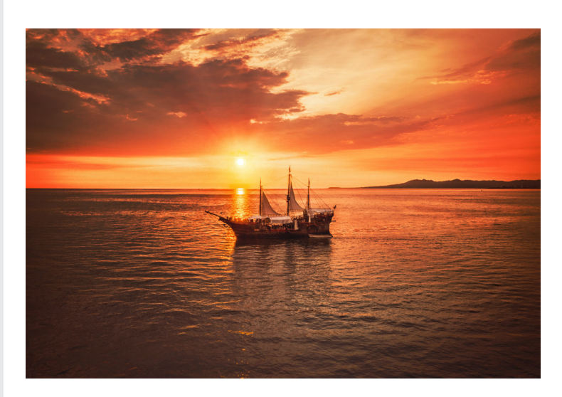
Who was Blackbeard?