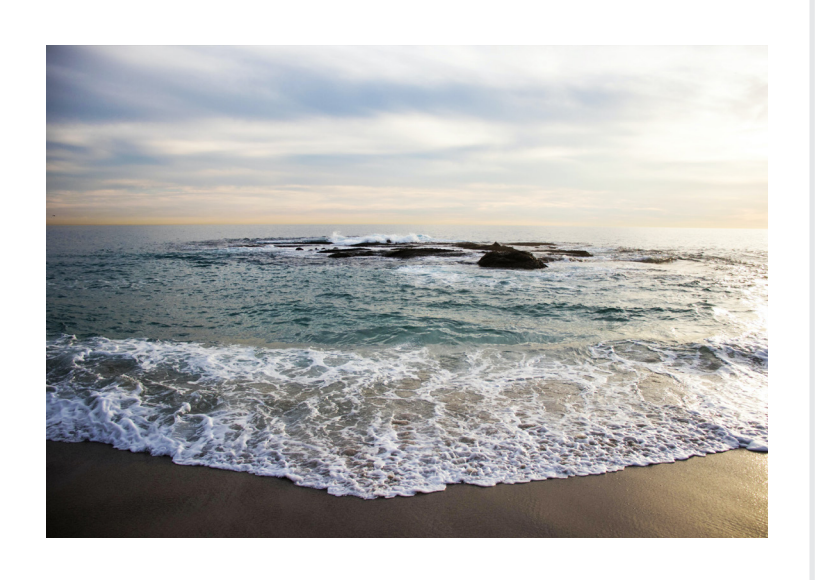
What is the biggest ocean?