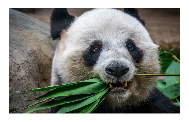
How many pandas are left in the wild?