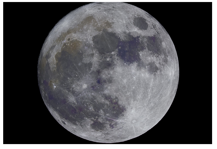
How long will it take for Astronaut foot prints to wear away on the moon?